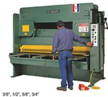
3/8", 1/2", 5/8", 3/4"