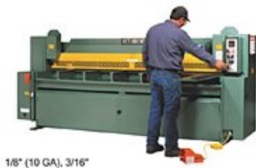
1/8" (10 GA), 3/16"